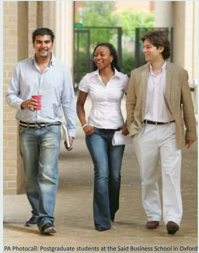
Postgraduate students at the Said Business School in Oxford